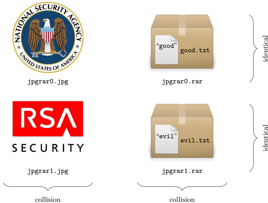
Fig. 2: Colliding JPEG/RAR polyglot file pair for malicious SHA-1 (cf. Table 4).

Now, we can append suitable followup blocks to create valid JPEG or RAR file pairs, both with arbitrary content. As an example, both images in Figure 2 hash to the colliding digest h(m) = 1896b202\ 394b0aae\ 54526cfa\ e72ec5f2\ 42b1837e using the malicious round constants K_1 = 5a827999, K_2 = 4eb9d7f7, K_3 = bad18e2f, K_4 = d79e5877 .